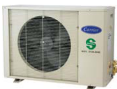
◀ 38RE Series

Carrier reserves the right to make changes in specifications without prior notice.